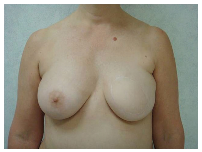
FIGURE 4. Left breast reconstruction with TRAM.