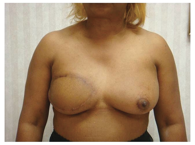
FIGURE 5. Right breast reconstruction with TRAM in an irradiated bed.

necrosis of the TRAM flap. The fat necrosis was located either superiorly or laterally on the flap. Those in the superior area correlated with the de-epithelialized skin above the navel during flap elevation. The majority of the patients had fat necrosis in this area (n = 8, 66.7%) compared with those with necrosis laterally (n = 4, 33.3%). Half of the patients underwent excision and closure of the fat necrosis, 1 patient