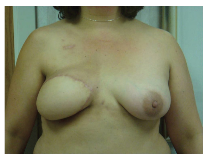
FIGURE 7. Right breast reconstruction with TRAM in an irradiated bed.

had debridement and healing by secondary intention, and the others resolved without treatment.